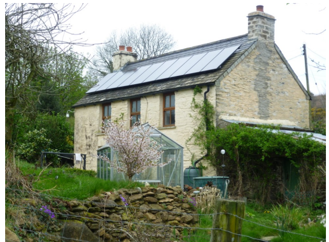
Making the Most of Pembrokeshire sunshine

A rolling system of cuts to solar feed-in tariffs (FITs) will be introduced to reflect expected drops in solar panel prices. Tariff rates will fall again in July and October, potentially by a total of 40%. They will then fall by 10% every six months unless the number of solar photovoltaic (PV) panels installed is above government forecasts. If this is the case, the cuts will come in earlier.