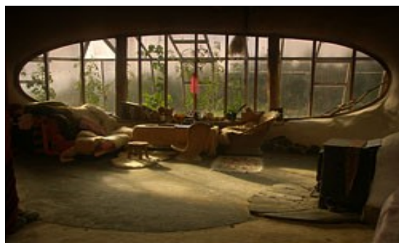
Simon and Jasmin's living room

“That LID and the common practice of building control are at odds has been acknowledged verbally on many occasions by PCC building controllers and by our building control surveyor in his court witness statement against us.”