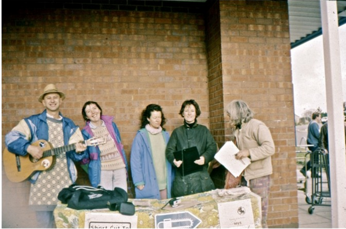
Pictured are supporters manning a stall, calling for a stop to the use of tropical hardwoods, outside a super-market in Haverfordwest during the 1990's.